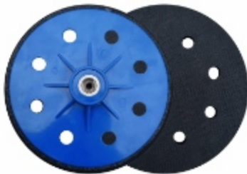
DRYWALL SANDER PAD